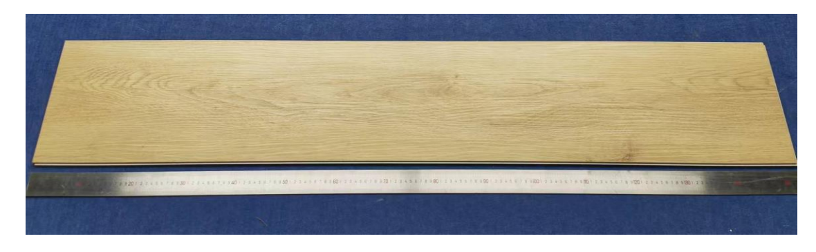
Front view(Test surface)