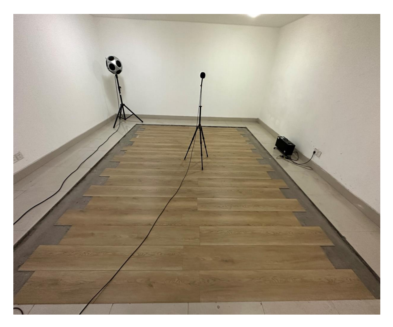
Test set up