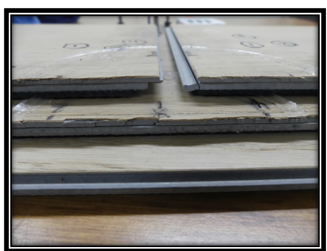
Recovered Swell (Disassembled)

"THIS REPORT APPLIES ONLY TO THE SAMPLES TESTED" Samples and their identifying descriptions have been provided by the client unless otherwise stated. NZWTA Ltd makes no warranty, implied or otherwise as to the source of the tested samples. The above results are designed to provide THE CLIENT WITH GUIDANCE INFORMATION ONLY. This document shall not be reproduced except in full.