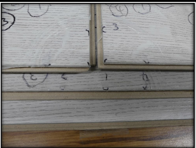
Recovered Swell (Disassembled)

"THIS REPORT APPLIES ONLY TO THE SAMPLES TESTED" Samples and their identifying descriptions have been provided by the client unless otherwise stated. NZWTA Ltd makes no warranty, implied or otherwise as to the source of the tested samples. The above results are designed to provide THE CLIENT WITH GUIDANCE INFORMATION ONLY. This document shall not be reproduced except in full.