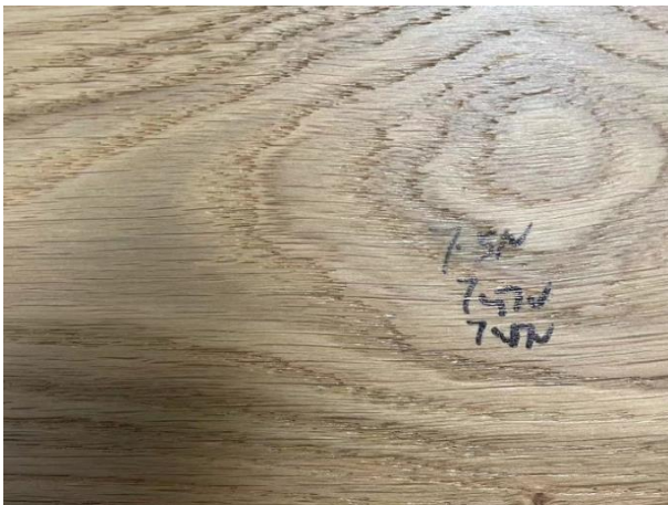
After test (Horizontal)