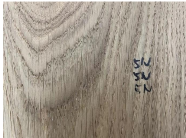
After test (Vertical)