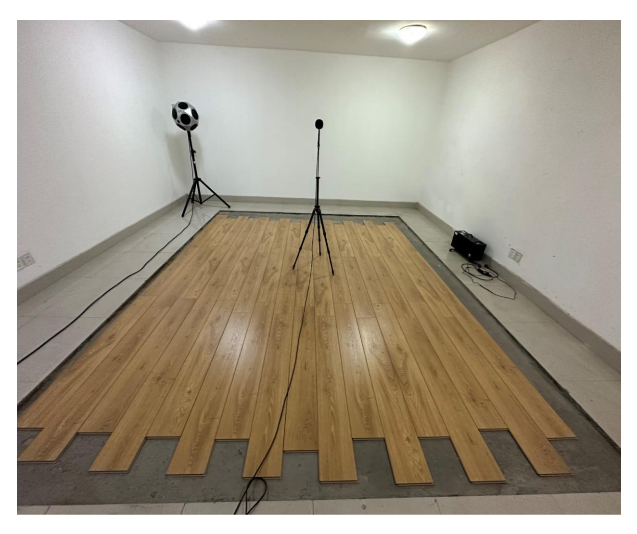
Test set up