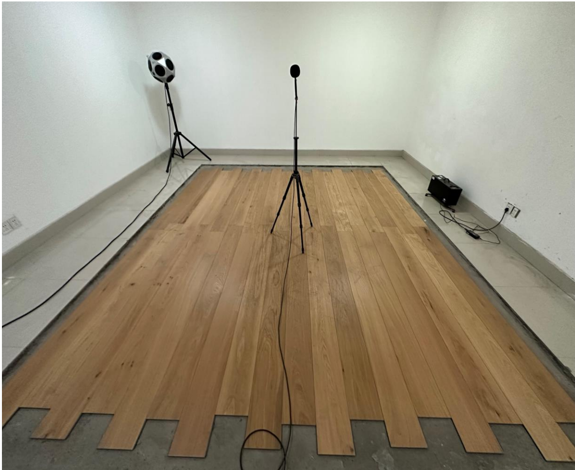
Test set up