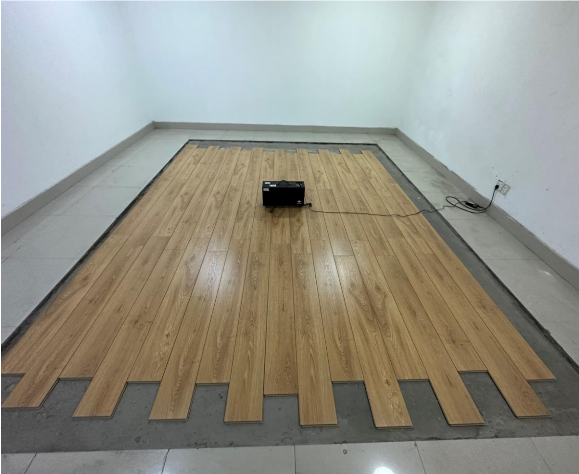
Test set up