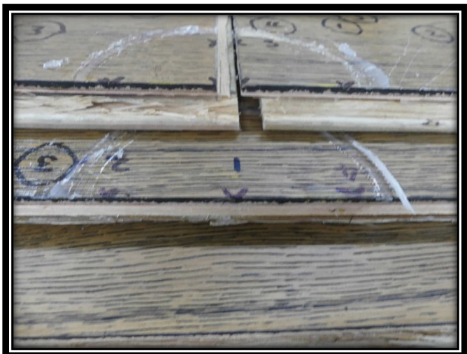
Recovered Swell (Disassembled)