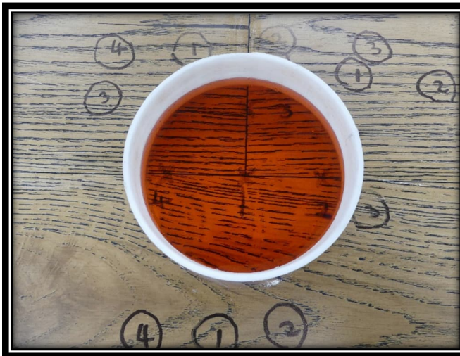
After 24 hrs With Water