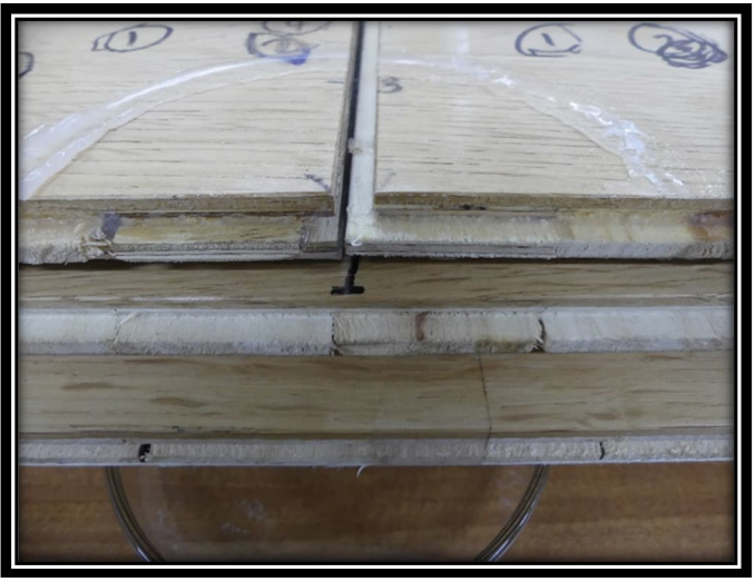
Recovered Swell (Disassembled)

"THIS REPORT APPLIES ONLY TO THE SAMPLES TESTED"