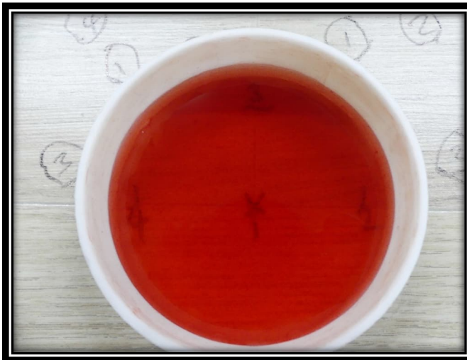
After 24 hrs With Water