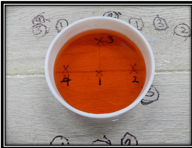
After 24 hrs With Water