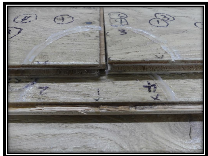
Recovered Swell (Disassembled)