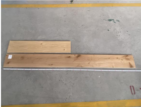
Front view(Test surface)